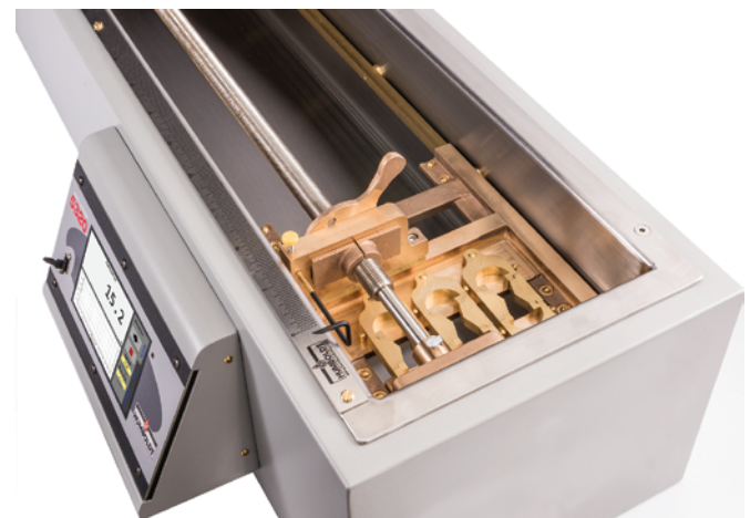
Interior of HA-1068 showing test molds, screw drive and disengage lever.

You will be able to run tests and display results while viewing tabulation, basic x-y graphs and instrument readings in real-time during the test. Test data is stored in the device and can be down-loaded to a USB drive via the machine's front USB port or the data can be transferred to a computer via the LAN port. A second USB port located on the back of the machine can also be used to power a wireless access point, which can provide a wireless hook-up with a computer, if no LAN is available.