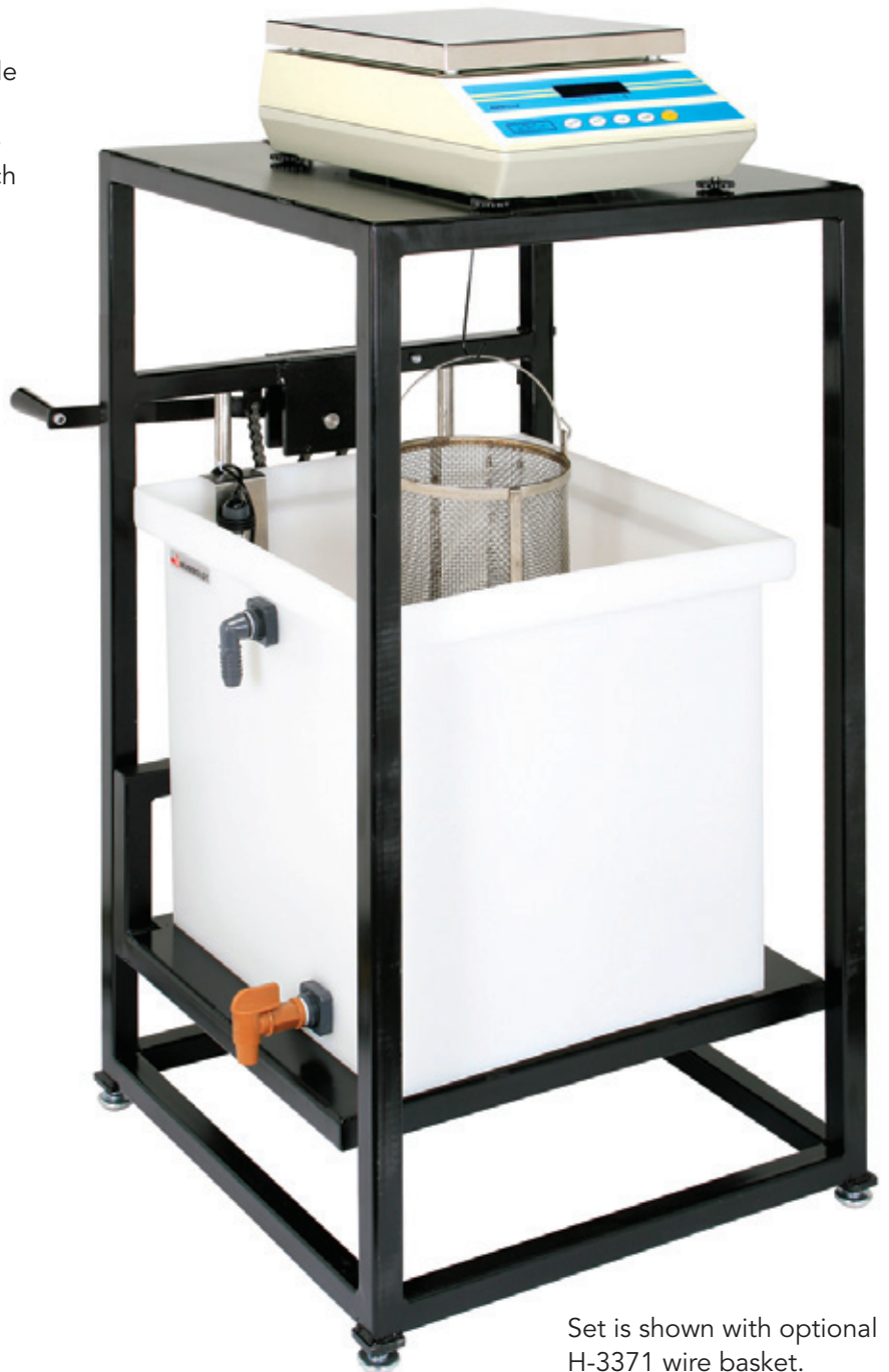
Set is shown with optional H-3371 wire basket.