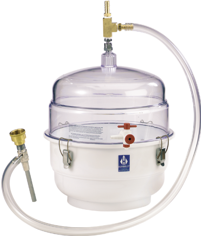
Large-Capacity Vacuum Pycnometer