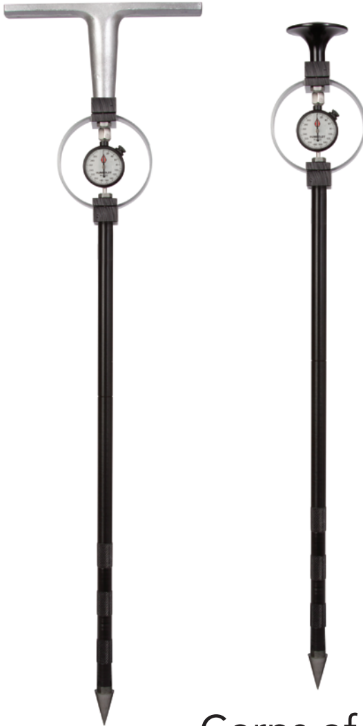
Corps of Engineers Cone Penetrometer