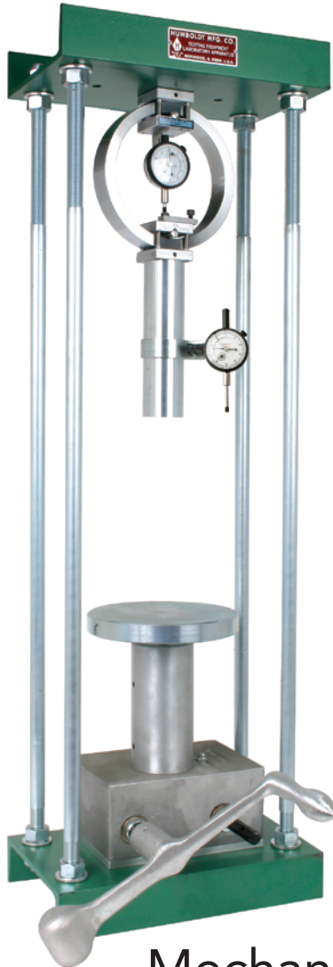
Mechanical Loading Press for CBR