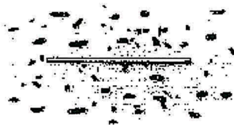
Fig. 2 A Clay Soil at the Plastic Limit.