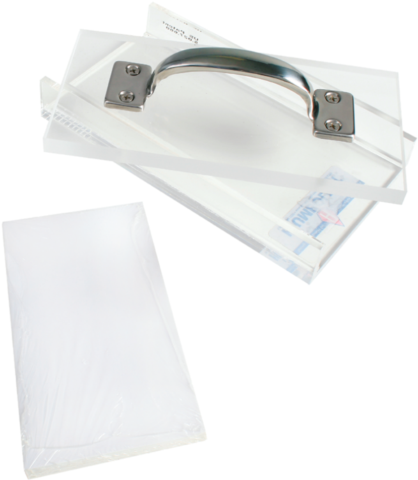
Plastic Limit Device