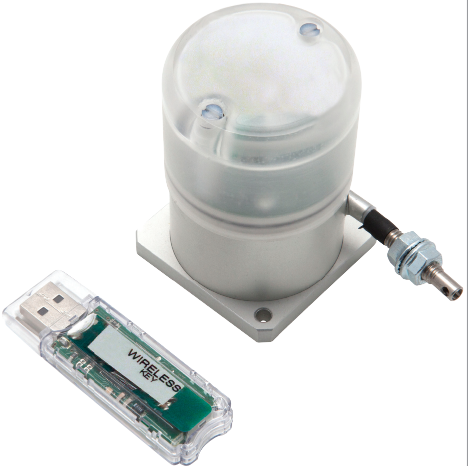
Concrete Crack Data Logger, Wifi