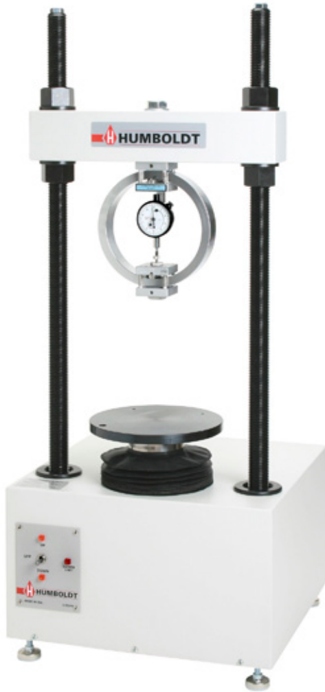
Marshall Compression Machine