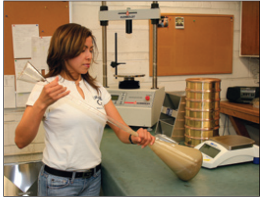
Humboldt Specific Gravity Flask (Phunque Flask)