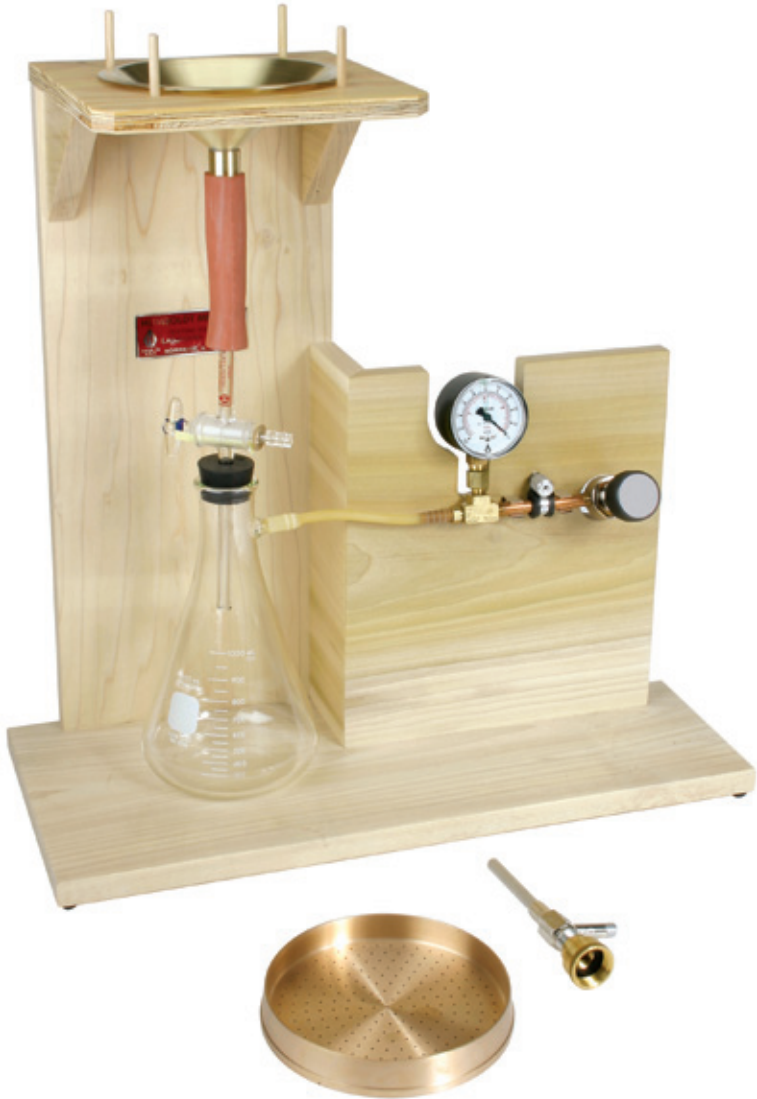
Water Retention Apparatus