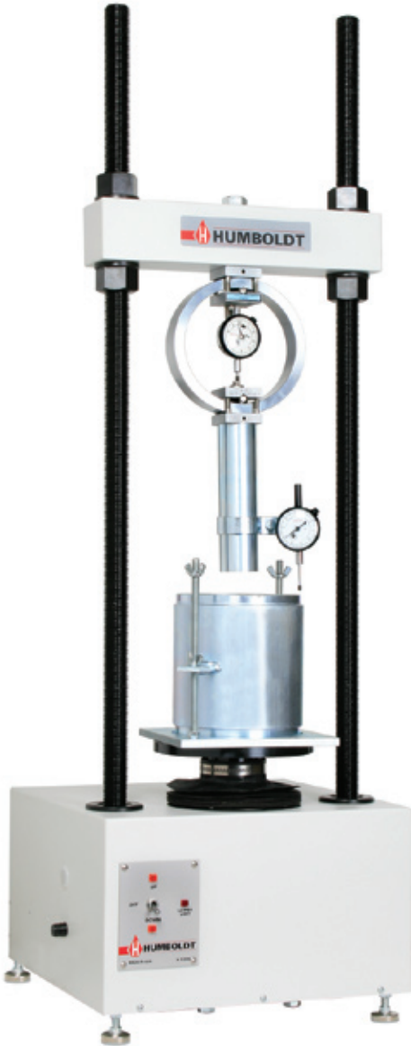
CBR-Specific Load Frame