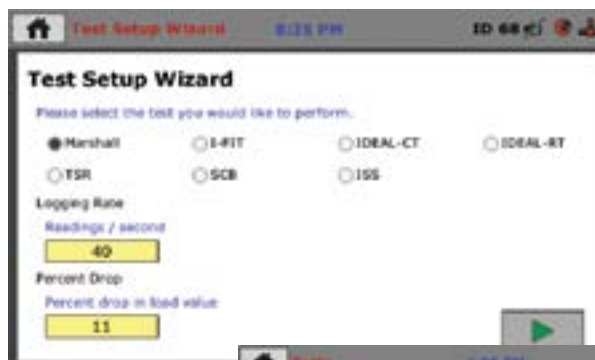
Auto-test setup wizard