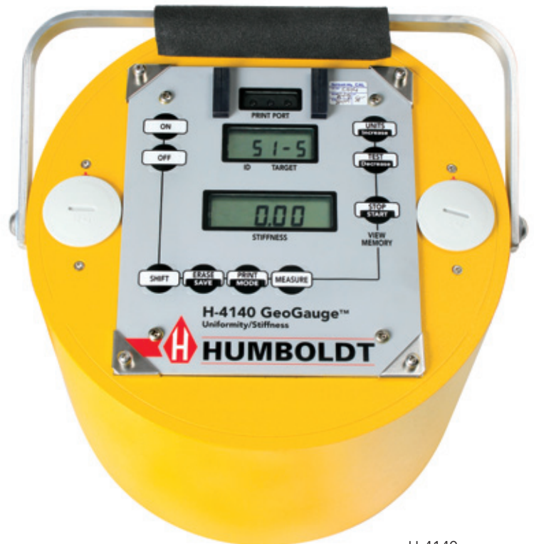
H-4140 Face Detail