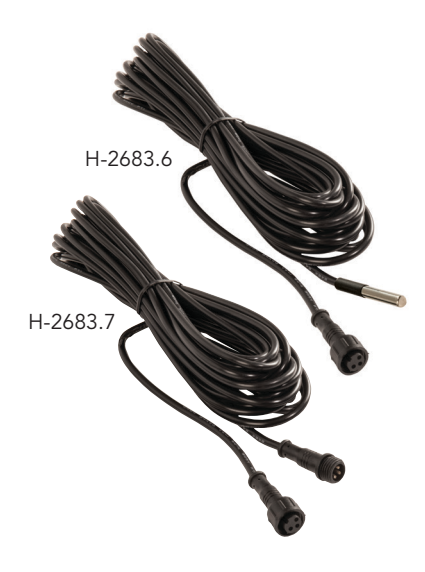
Humboldt Maturity Sensor System Components