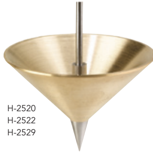
H-2520 H-2522 H-2529