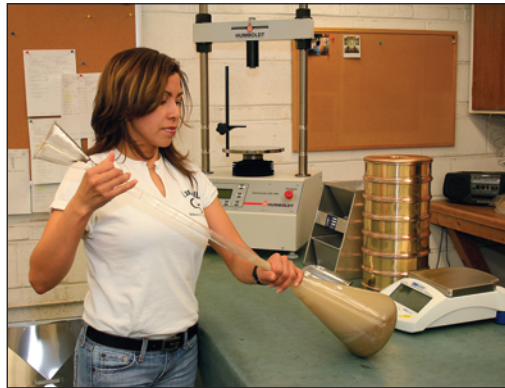
Humboldt Specific Gravity Flask (Phunque Flask)