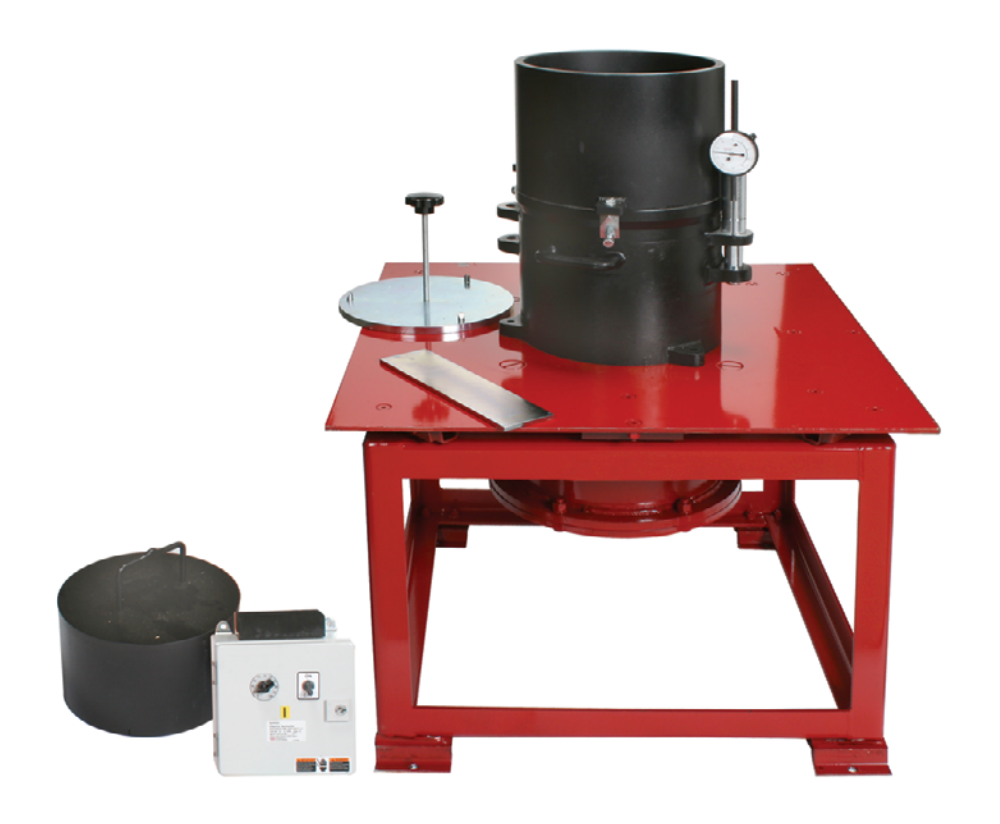
Relative Density Mold Set