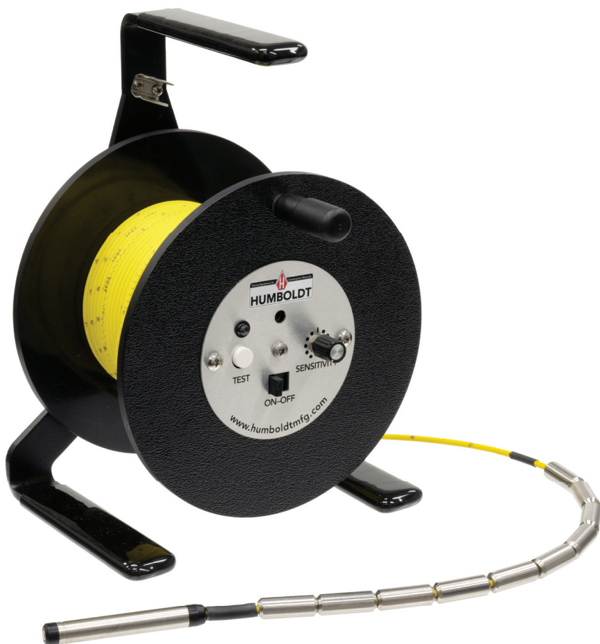
Deluxe Water Level Indicators