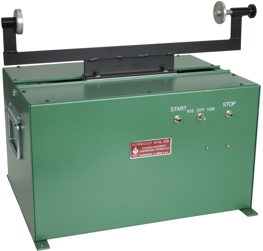
Sand Equivalent Shaker