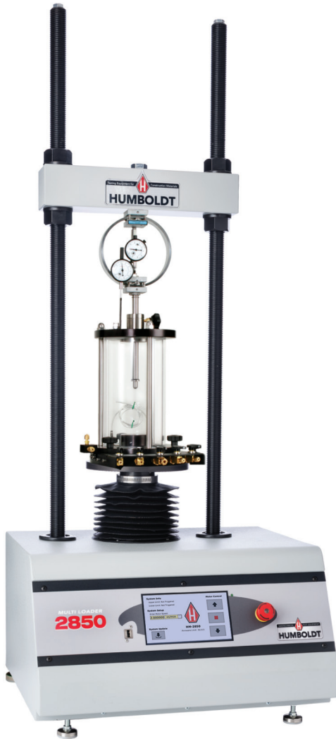
Humboldt Multi-Speed Load Frame