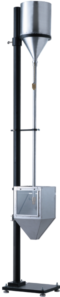
Falling Sand Abrasion Tester