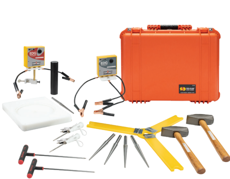
EDGe Starter Unit - H-6500.3F