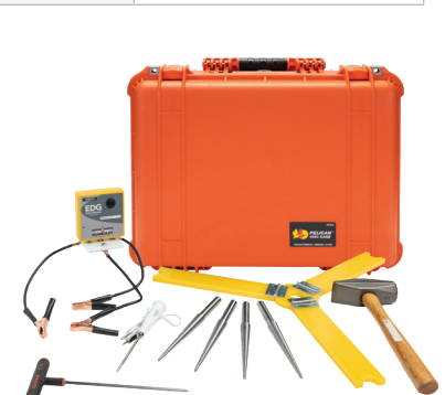
EDGe Field Unit - H-6500F.3F

Shipping Weight: 11lbs (4.9Kg) Shipping Dims: 16" x 16" x 6" (406 x 406 x 152 mm)