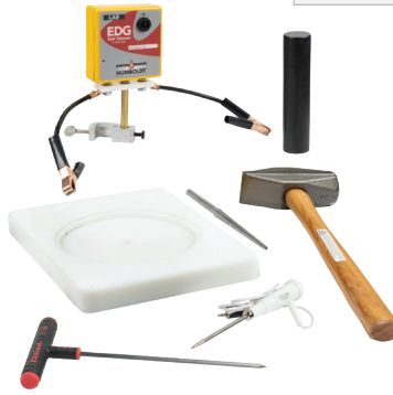
EDGe Lab Unit - H-6500L.3F