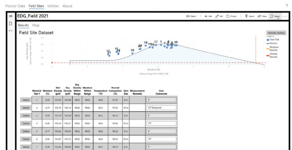
Field Site Data

tional project information such as the project name and number, the EDGe field sensor's unique identification number, the EDGe operator's name, the company name, and other information in the remarks section, such weather conditions, if needed.